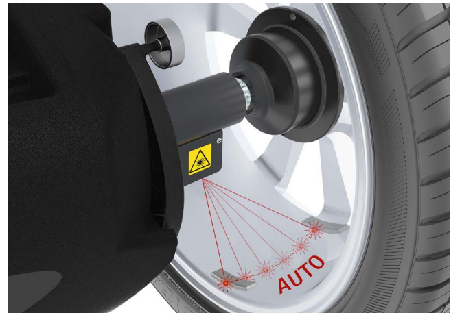
Easy weight positioning with laser pointer