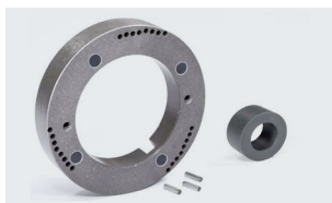
Distance ring and spacer For extending the balancing flange for very deep rims Order number: 1 695 901 667